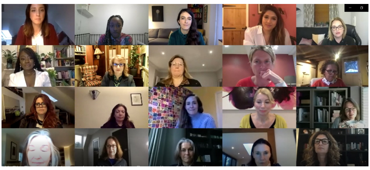
What Senior Women can Learn from the Next Generation of Senior Women